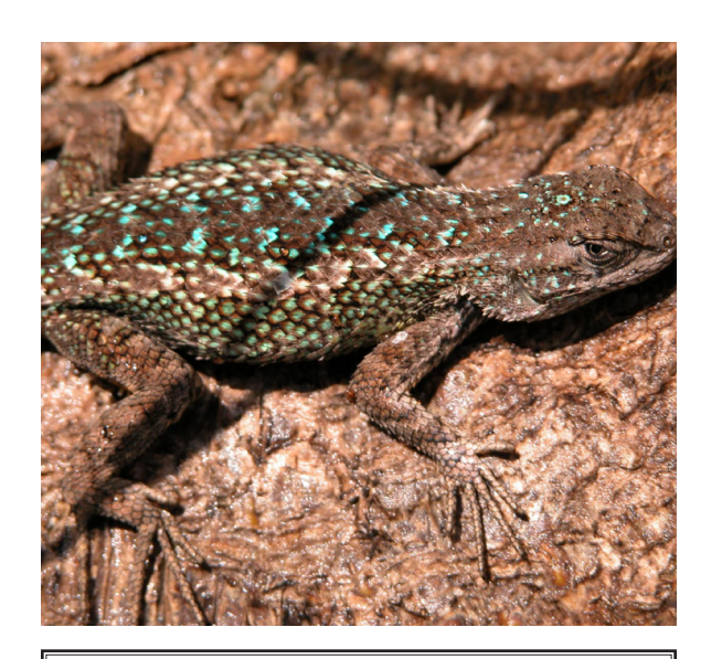
Western Fence Lizard Sceloporus occidentalis

I live primarily in California, but can also be found in eastern and southwest Oregon, Columbia River Gorge, southwest Idaho, Nevada, and western Utah.