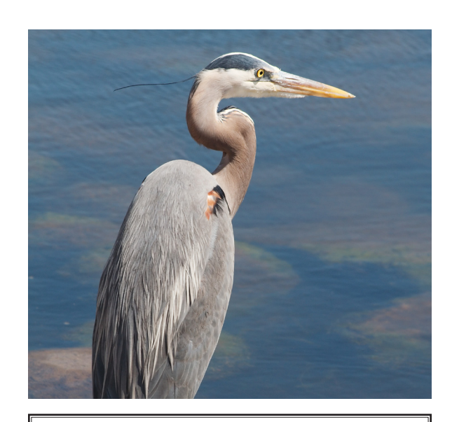
Great Blue Heron Ardea herodias

I am a scavenger. I primarily feed on carrion.