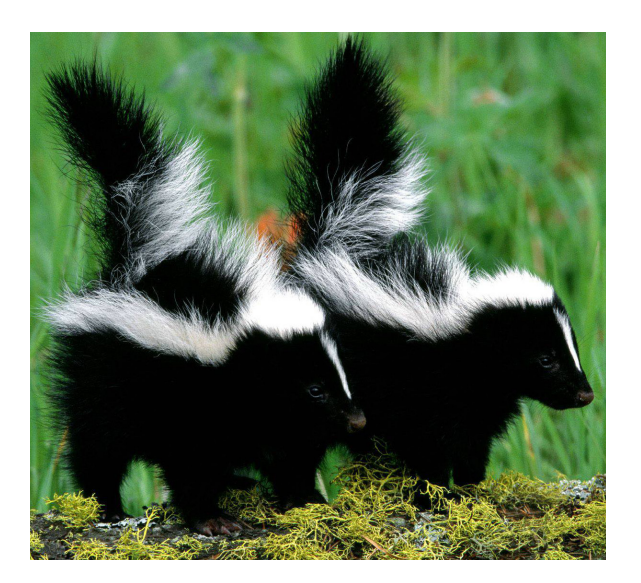
Striped Skunk Mephitis mephitis

I am an omnivore. I eat seeds, grasses, pickleweed, and insects.