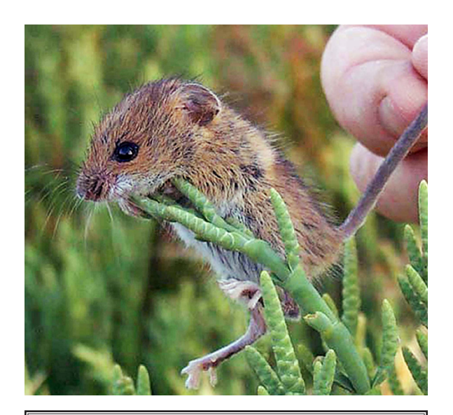
Saltmarsh Harvest Mouse Reithrodontomys raviventris

I am a tiny rodent that lives in wetland and marsh habitats throughout California.