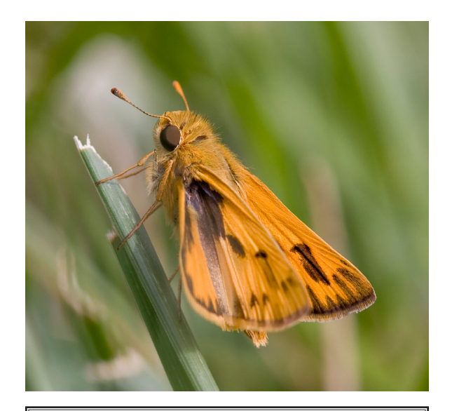
Skipper Butterfly Hylephila phyleus