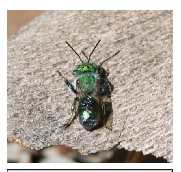
"Native Bee" Osmia lignaria

I live throughout the United States and Canada.