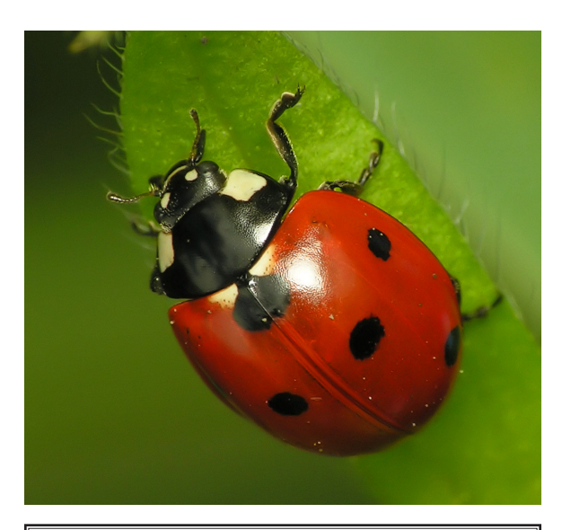
Ladybug Coccinella septempunctata