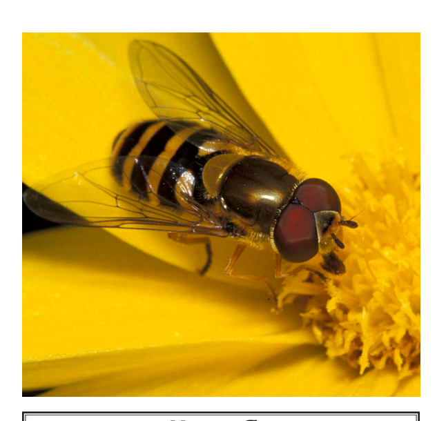
Hoverfly Simosyrphus grandicornis

I am an onmivore. I eat aphids and other small insects.