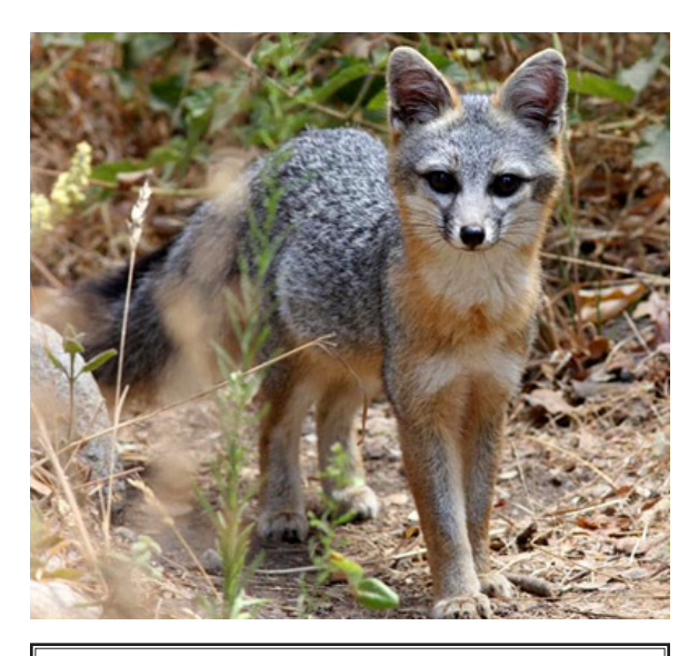
Gray Fox Urocyon cinereoargenteus