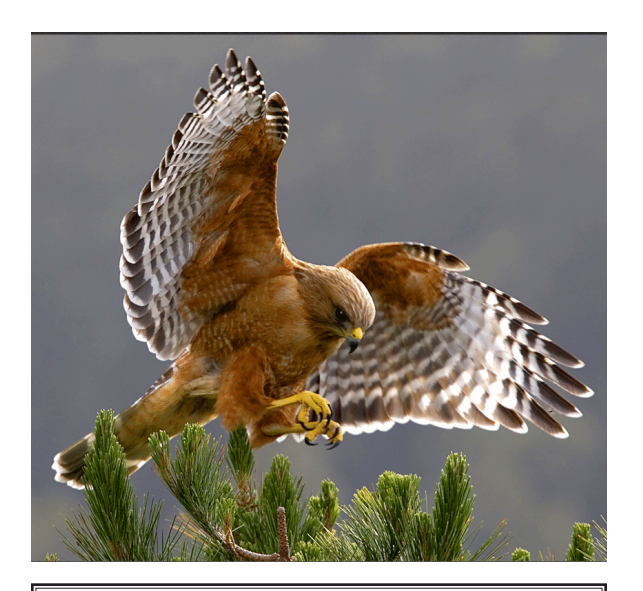
Red-shouldered Hawk Buteo lineatus

I live in southern Canada and coastal regions of the United States.