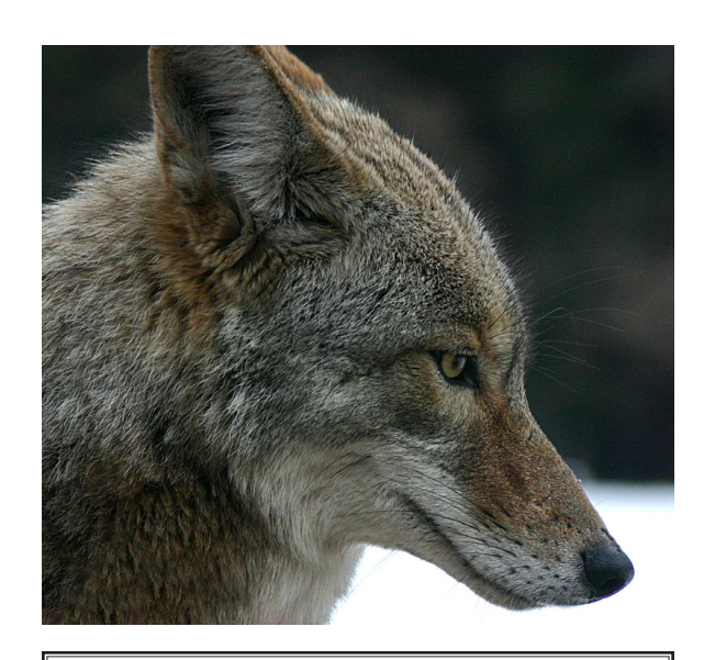
Coyote Canis latrans

I am an herbivore. I eat grasses and many other herbaceous flowering plants such as the California sunflower, milkweed, and clovers.