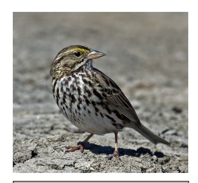
Belding's Savannah Sparrow Passerculus sandwichensis beldingi

I am an omnivore. I primarily eat seeds, but I also eat insects.