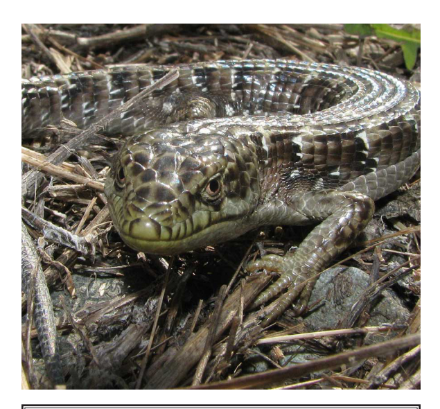
Southern Alligator Lizard Elgaria multicarinata

I am a carnivore. I eat insects and spiders.