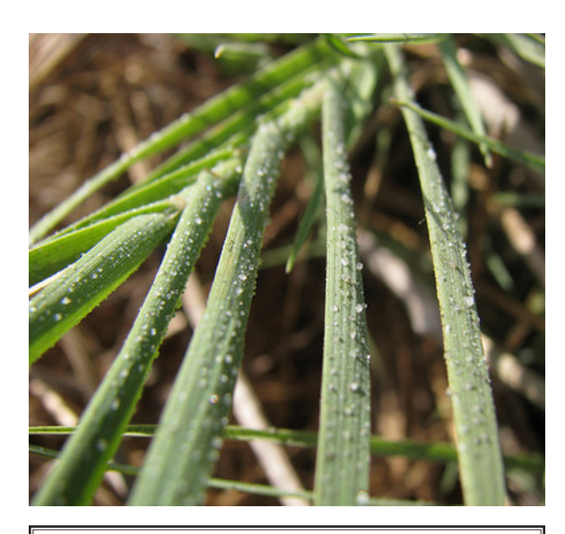
Saltgrass Distichlis spicata

My flowers bloom between April and September.