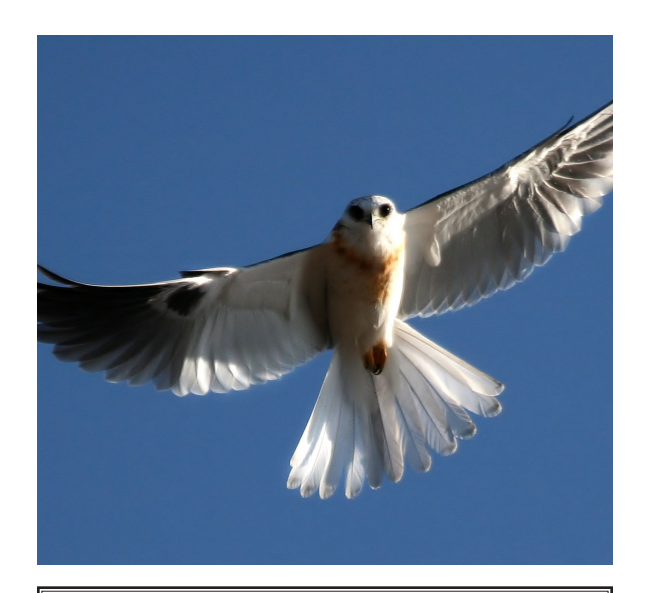
White-tailed Kite Elanus leucurus

I live in open woodlands, desert grasslands, marshes and partially cleared fields.