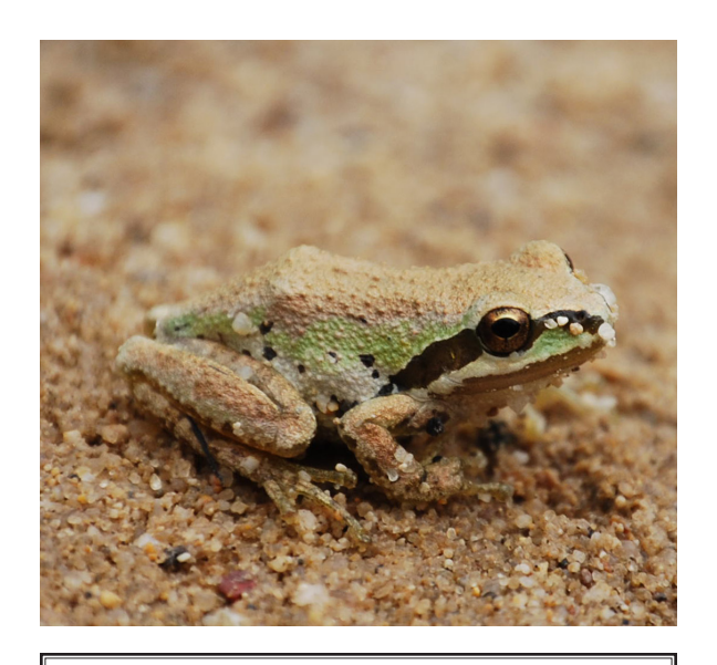
Pacific Tree Frog Pseudacris regilla

I live along the Pacific Coast of North America (southern Canada to southern California).