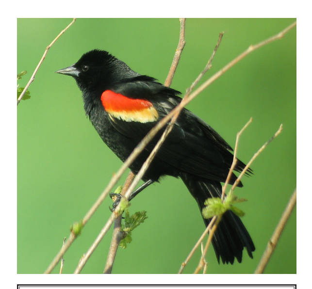
Red-winged Blackbird Agelaius phoeniceus

I am a carnivore. I primarily feed on small mammals.