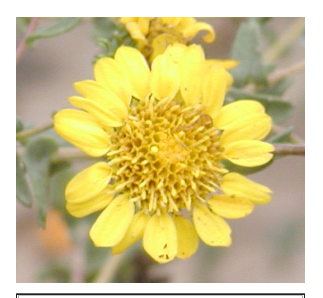
Gumplant Grindelia camporum

I am a bushy, leafy plant with bright yellow flowers.