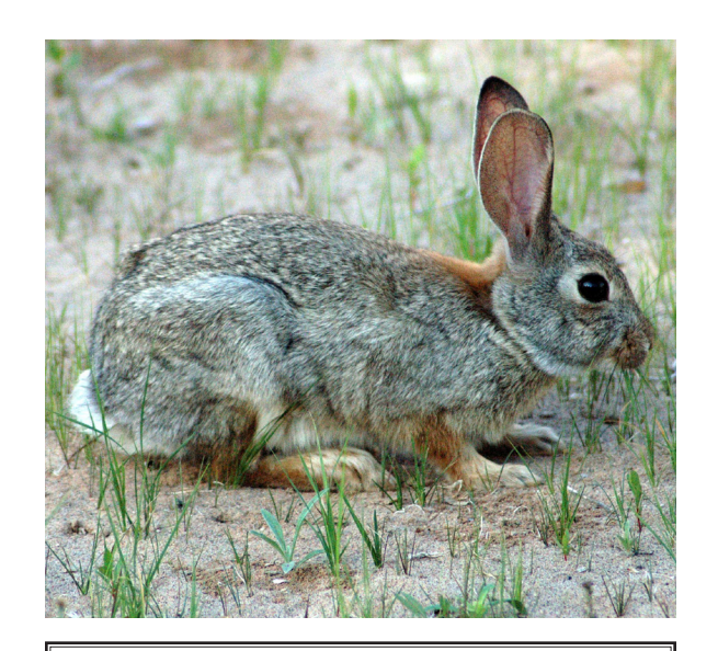
Brush Rabbit Sylvilagus bachmani

I have woolly, bristly, tan and brownish flowers.