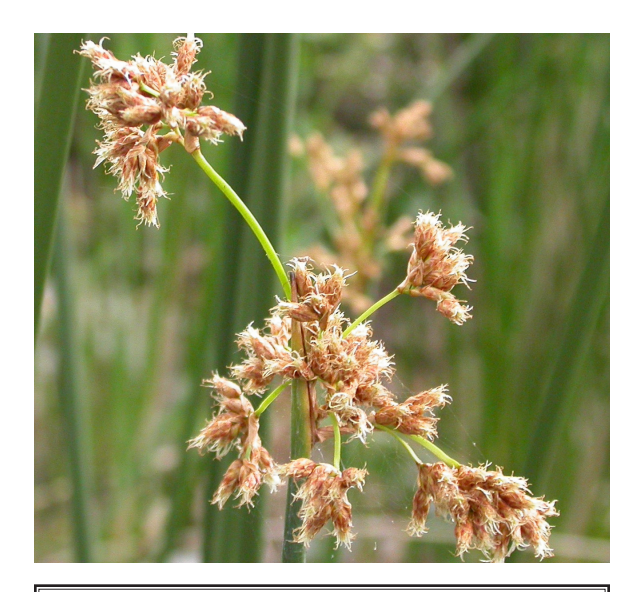
California Bulrush Schoenoplectus californicus

I have a tall, thin, dark green stem that is usually triangular.