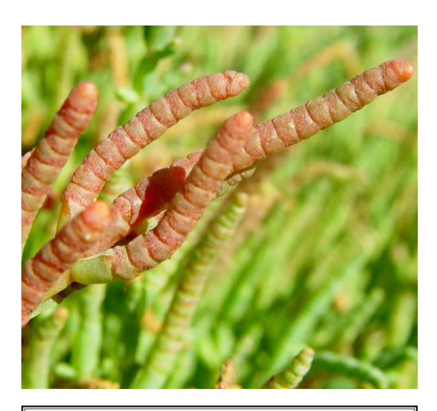
Pickleweed Salicornia virginica

My flowers bloom between August and October.