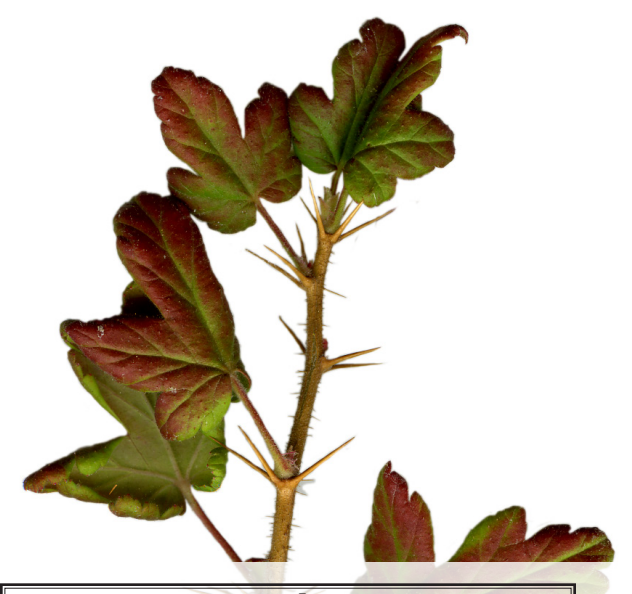
Gooseberry Ribes speciosum