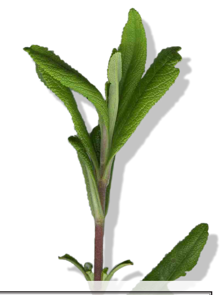
Black Sage Salvia mellifera