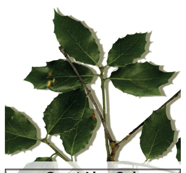
Coast Live Oak Quercus agrifolia

I am an evergreen tree and can reach a mature height of 10-25 m.