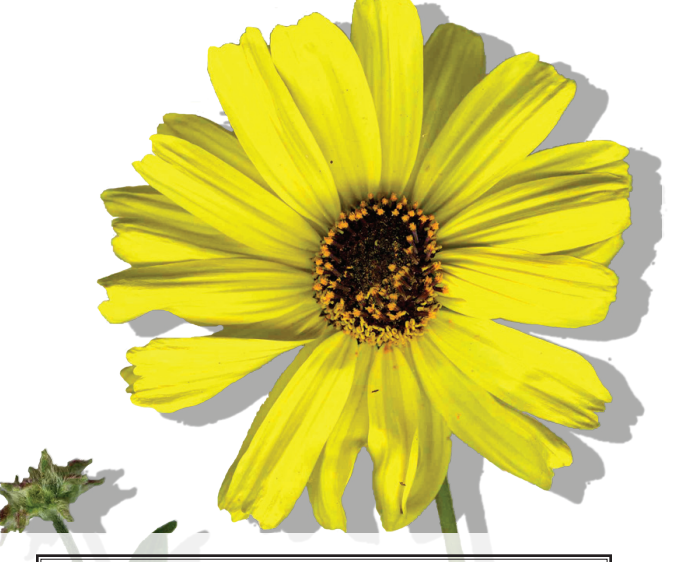
California Sunflower Encelia californica