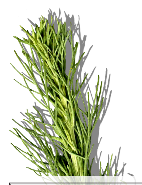
California Sagebrush Artemisia californica

I am an important winter food source for quail, pheasant and grouse.