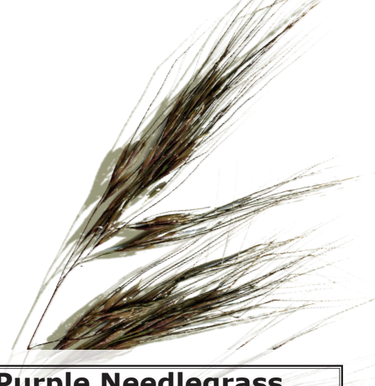
Purple Needlegrass Stipa pulchra