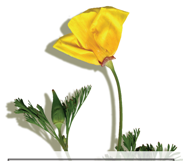
California Poppy Eschscholzia californica

My flowers are white with a yellow center.