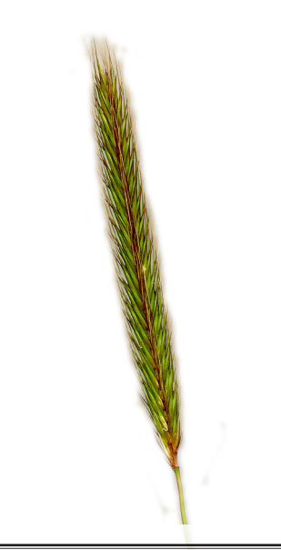
California Barley Hordeum brachyantherum californicum

I am a perennial grass with hairs on my leaves and a reddish flowering stalk.