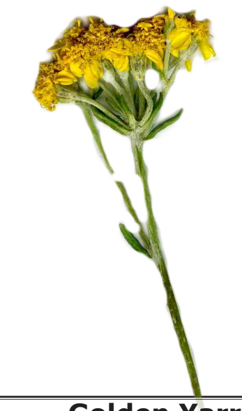
Golden Yarrow Eriophyllum confertiflorum