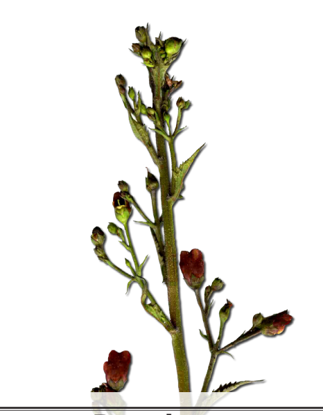
Beeplant Scrophularia californica