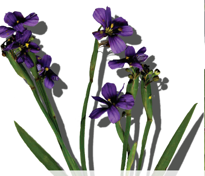
Blue-eyed G rass Sisyrinchium bellum