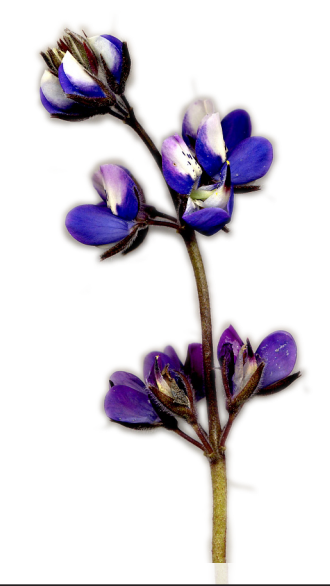
Miniature Lupine Lupinus bicolor

I have a noncompetitive nature, so it is difficult for me to grow near weeds.