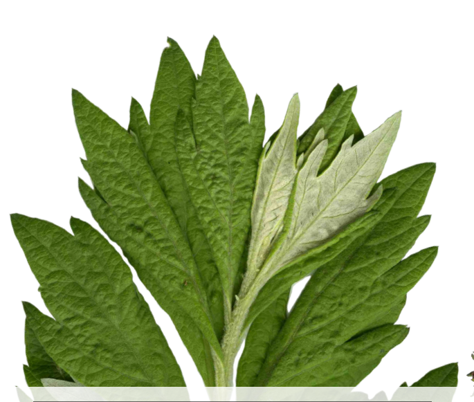
Mugwort Artemisia douglasiana