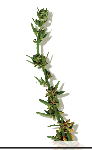
Deerweed Acmispon glaber