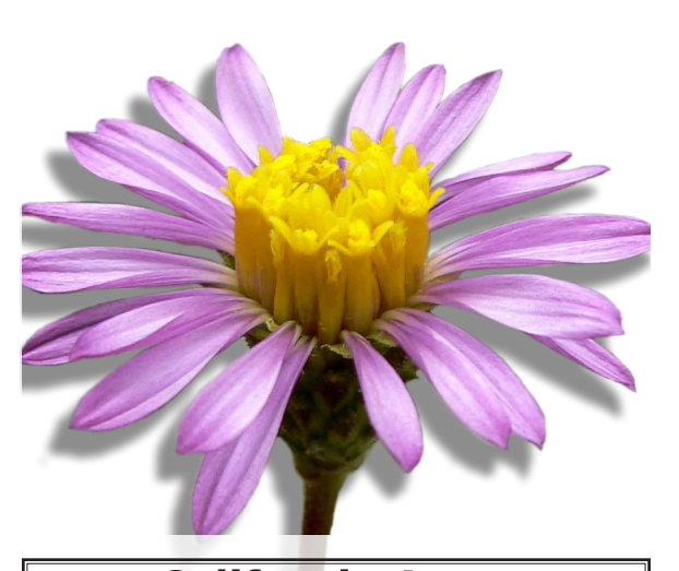
California Aster Corethrogyne filaginifolia