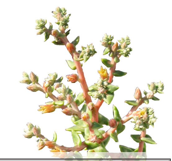
Lanceleaf Liveforever Dudleya lanceolata

The California Oak Moth ( Phry-ganidia californica ) subsists entirely on leaves of the Coast Live Oak.