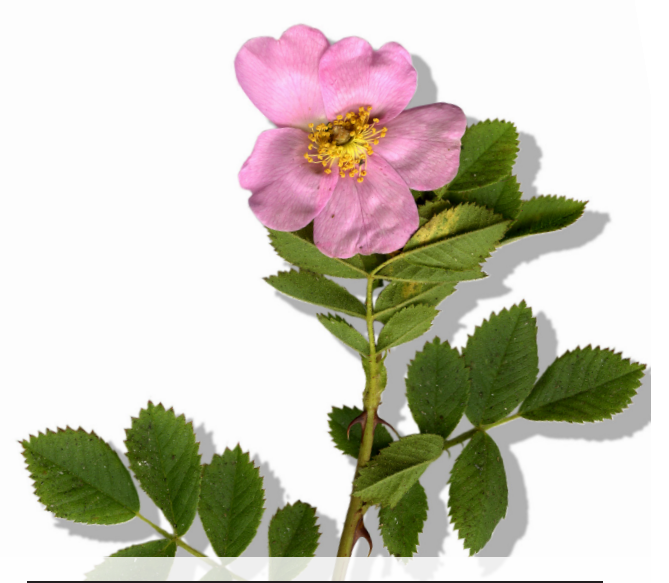
California Wild Rose Rosa californica