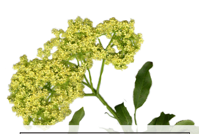
Blue Elderberry Sambucus nigra