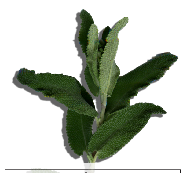
Purple Sage Salvia leucophylla