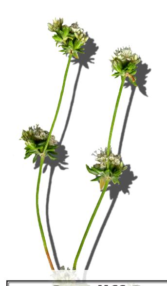
Seacliff Buckwheat Eriogonum parvifolium

I spread by rhizomes. Rhizome means root stalk.