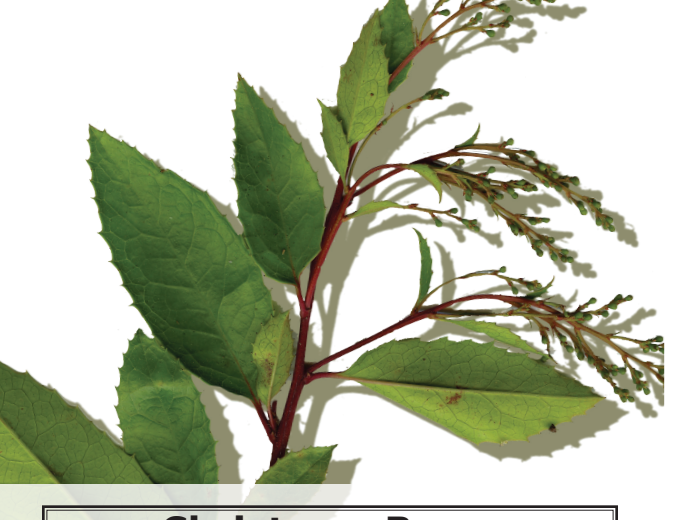
Christmas Berry Heteromeles arbutifolia

My stems are strong even though they are hollow and can be used to make flutes and clapper sticks.