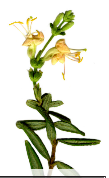
Honeysuckle Lonicera subspicata