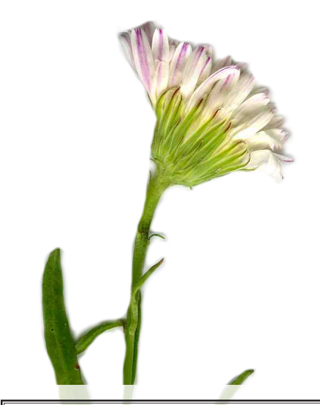
Sea Cliff Daisy Malacothrix saxatilis