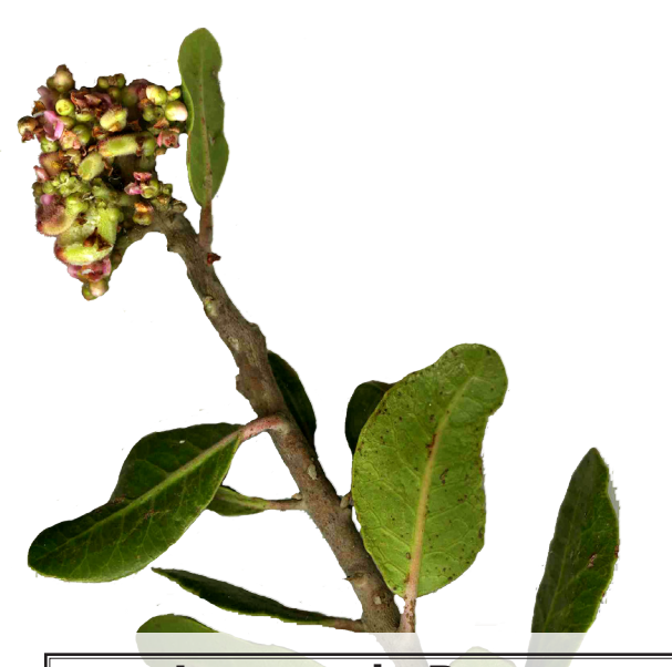
Lemonade Berry Rhus integrifolia