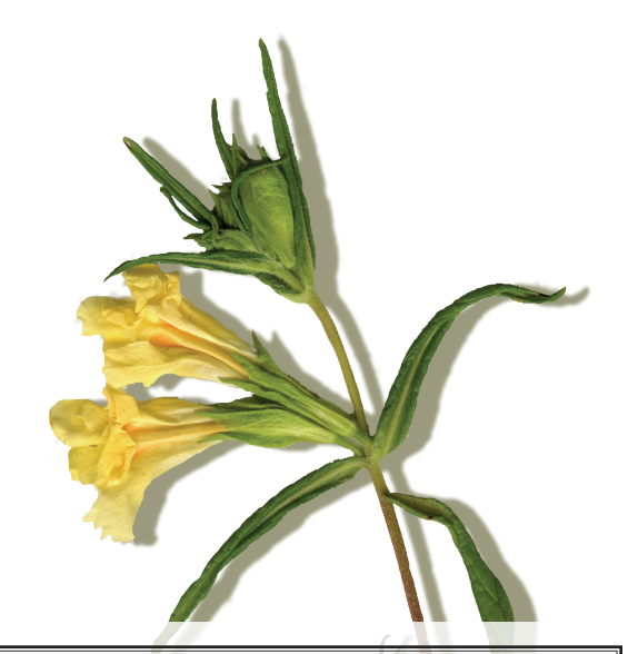
Monkey Flower Mimulus aurantiacus