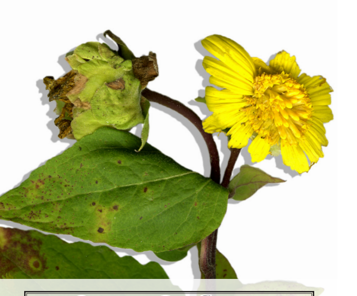
Canyon Sunflower Venegasia carpesioides