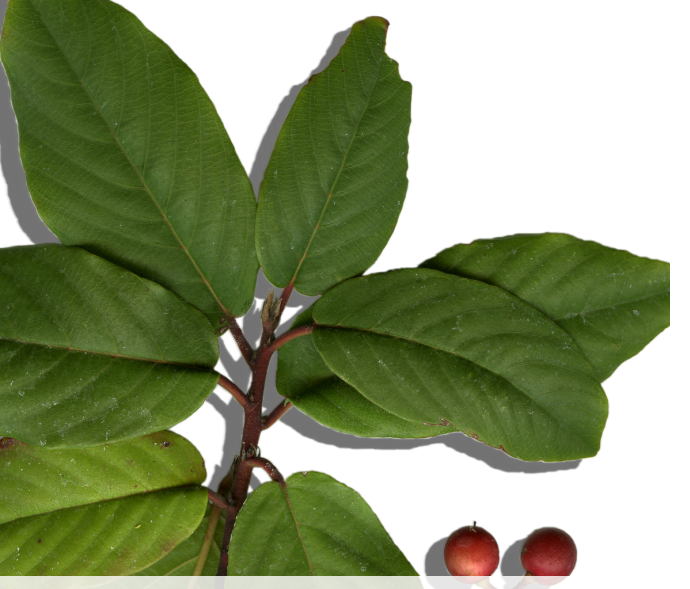
Coffeeberry Frangula californica