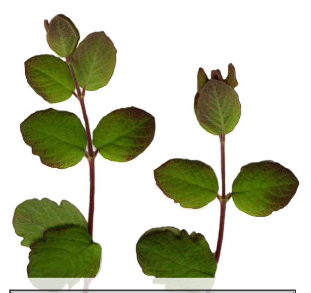
Snowberry Symphoricarpos albus